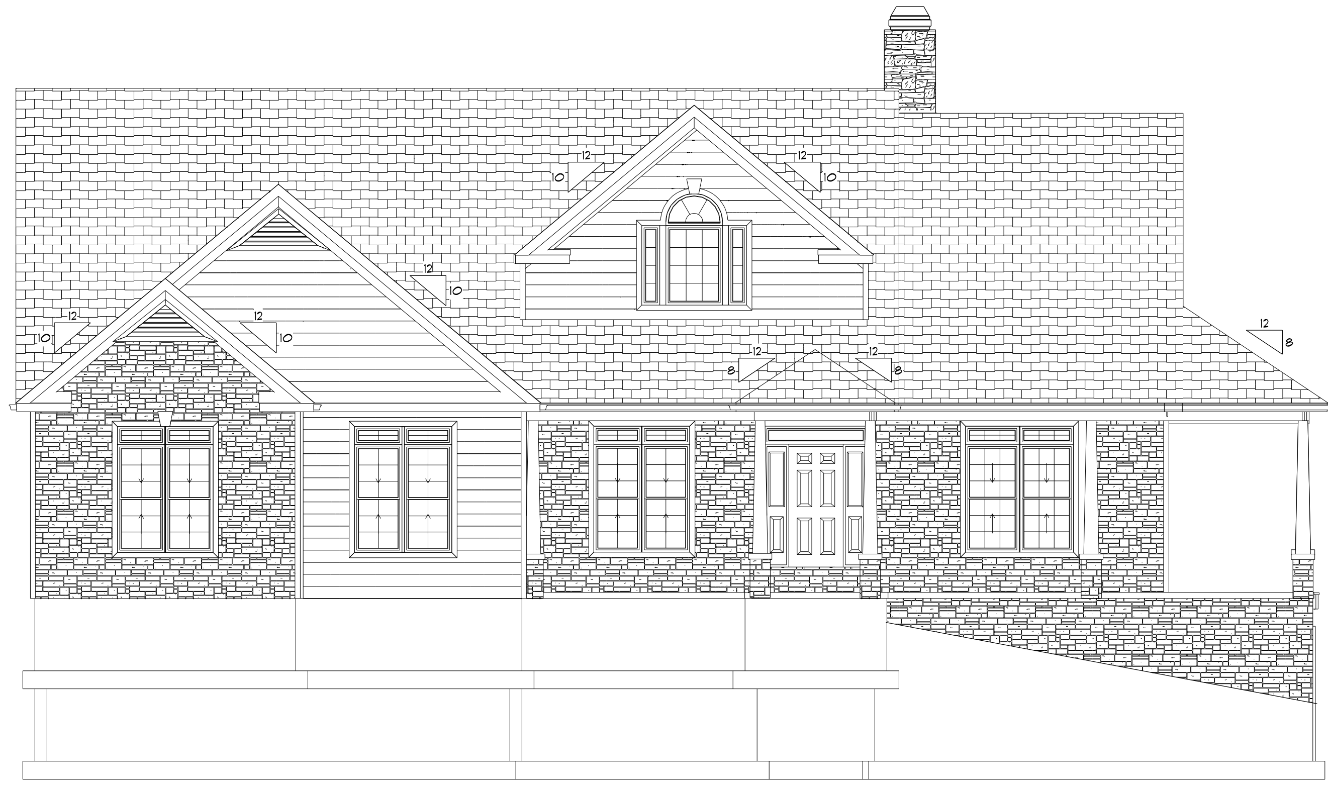
FRONT ELEVATION SCALE: 3/16" = 1'-0"

Custom Home Design By Rockdale Drafting LLC